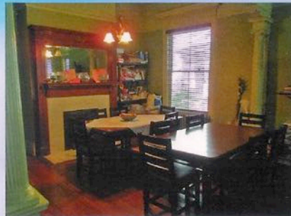
Women learn to live together and regain their dignity and self-worth.