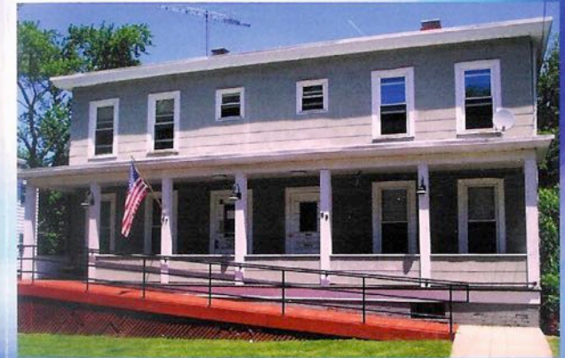
Open Arms Men's Residence House 57 Sharp St., Haverstraw, NY 10927 Phone: (845) 429-9514