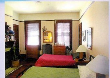
Clean, comfortable living areas for 12 women. Everyone shares in doing chores and learning to be responsible adults.