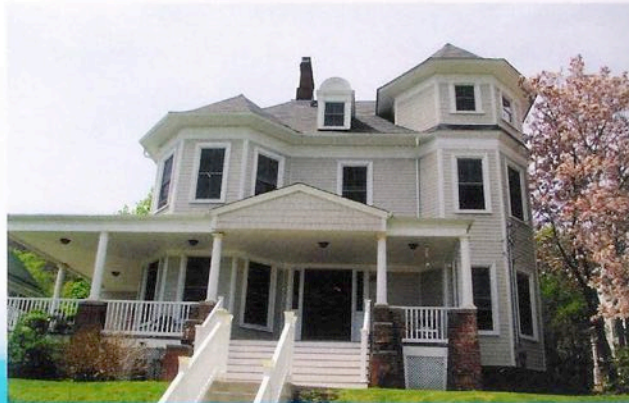
Open Arms Women's Residence 74 Hudson Ave, Haverstraw, NY Phone: (845) 271-3787

In 1985 Open Arms Inc. became a not-for-profit corporation (501-C3) receiving state and federal tax-exempt status. A Board of Directors was created to support the agency. In 1989 Open Arms Inc. opened 8 clean and sober apartments in Garnerville. In 1995 Open Arms opened the first state certified "supported living" apartments for women in Garnerville. In 2003 Open Arms received the Award of Excellence from the Rockland County Executive for "exemplary support of employment for persons with disabilities". In 2005 the Open Arms women's program expanded to 20 state certified apartment beds and a Child Visitation Center opened. In 2011 the ¾ house at 74 Hudson Ave. was converted into a 12 bed halfway house for women after an extensive renovation was completed. In 2014 the Supported Living program was transferred to a single rental building at 4 Broadway in Haverstraw with 6 beds. In the coming years we hope to renovate the Men's House on Sharp Street as a showcase for Recovery Living.