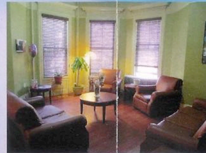
Open Arms offers a safe, supportive 12 Step environment for Recovery.